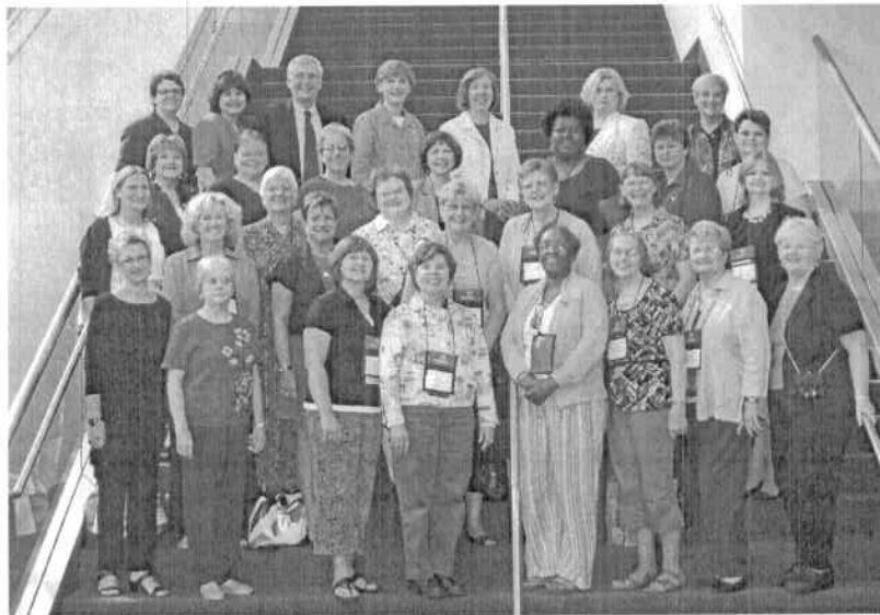
Members of the cohort who took the first certification examination in 1983 honored at CBIC Reception at APIC National Conference in June.

2008 is the last year the SARE will be available in a pencil and paper hard copy booklet format. In 2009, the SARE will be available only as a web-based computer exam, but will still be designed for the certifying candidates to complete at their own pace within the calendar year in which their certificate would expire.